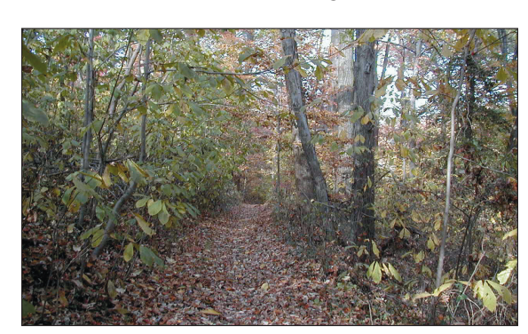
There are existing natural surface trails at Fort Foote Park that provide access to the river.

Improvements necessary to enhance access to Fort Foote include continuous sidewalks and designated bike lanes along Fort Foote Road.