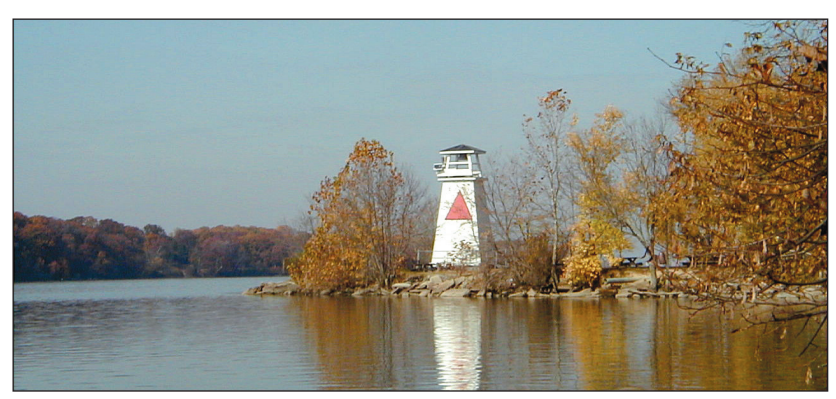
Fort\ Washington\ Park\ includes\ the\ only\ lighthouse\ in\ Prince\ George\ 's\ County.

Fort Washington Park: Constructed between 1814 and 1824, this site is owned by the National Park Service. After the original fort on the site was destroyed in 1814, the present fort was erected to protect the capital city. In addition to the restored fort and surrounding structures, this park also includes Prince George's County's only lighthouse, miles of natural surface trails, and expansive views of the Potomac River. Interpretive information is provided for the fort and a