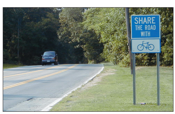
Oxon Hill Road currently has fragmented and missing sidewalks in many areas.

Fort Foote National Park: Established in 1863, Fort Foote, owned by the National Park Service, consists today of the remains of a Civil War fort and its related earthworks, ten gun mounts, and two Rodman guns. It was the southernmost of 68 forts and batteries erected to defend the city of Washington during the Civil War. This park includes several internal trails that take visitors through the woodlands along the Potomac River, by the historic cannons, and to the Potomac River shoreline. This park provides access to the Potomac River for the Fort Foote community. Although this park is located directly off Fort Foote Road, community access is minimal due to limited on-site facilities and fragmented sidewalks and bike facilities from surrounding neighborhoods. Additional improvements have been discussed for the park such as a visitor's center and interpretive features.