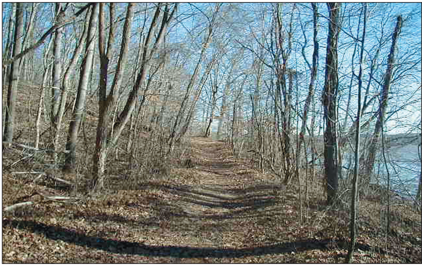
Existing natural surface trail along the north side of Piscataway Creek.