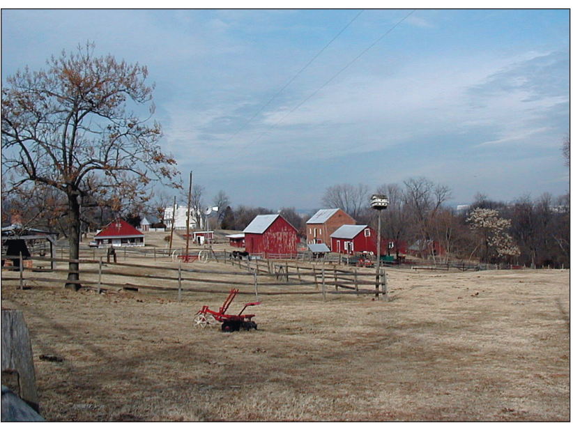
Oxon Hill Farm, Oxon Cove Park.

Oxon Cove Park (Oxon Hill Children's Farm): This site is owned by the National Park Service and includes a network of natural surface trails and a paved trail connection into the District of Columbia. Access to the waterfront is provided along Oxon Cove. Oxon Cove Park was purchased by the National Park Service as an example of a small, working farm that represents the time when farming was mostly nonmechanized and much of the work was completed using horses.