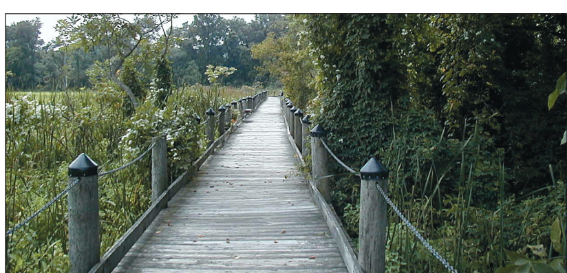
Boardwalk leading to Mockley Point.