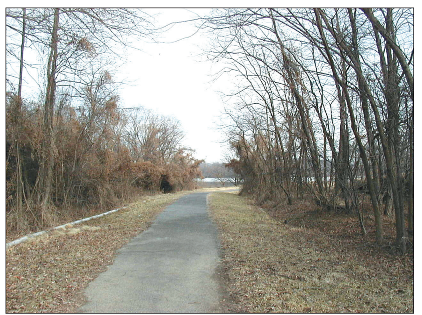
Existing trail along Oxon Cove, Oxon Cove Park.

In fall 2000, the first PHT on-road bicycle route map was published. This route connects parks, public facilities, and existing multiuse trails. It provides access to various sites along the river and also provides scenic vistas of the Potomac along various sites along the Prince George's County shoreline. In 2005, the on-road bicycle route was officially designated by the National Park Service as part of the Potomac Heritage National Scenic Trail. The existing bike route combines outdoor recreation, community-based heritage tourism, education, and conservation, all of which contribute to the county's Livable Communities Initiative. The route highlights the many locations along the Potomac River such as Fort Foote and Fort Washington that make Prince George's County unique. Significant natural, cultural, historical, and recreational resources along the corridor include: