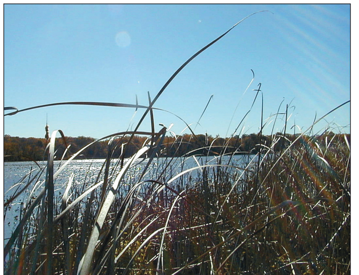
Broad Creek Marsh.

Broad Creek Marsh: Much of the marsh is currently owned by M-NCPPC and the National Park Service. Broad Creek Marsh is the largest marsh on the Potomac River within Prince George's County. The parkland also includes a large amount of high quality riparian habitat surrounding the marsh and Broad Creek. The marsh supports a wide variety of wildlife, including several species of nesting marsh birds, nesting bald eagles, and a wide variety of wading birds and waterfowl.