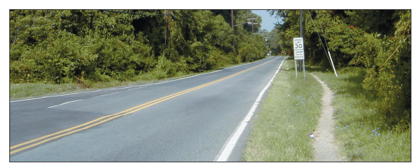
Existing facilities for pedestrians and bicyclists are fragmented or missing in many areas. Continuous sidewalks and designated bike lanes are recommended.

Broad Creek Marsh: Much of the marsh is currently owned by M-NCPPC and the National Park Service. Broad Creek Marsh is the largest marsh on the Potomac River within Prince George's County. The parkland also includes a large amount of high quality riparian habitat surrounding the marsh and Broad Creek. The marsh supports a wide variety of wildlife, including several species of nesting marsh birds, nesting bald eagles, and a wide variety of wading birds and waterfowl.